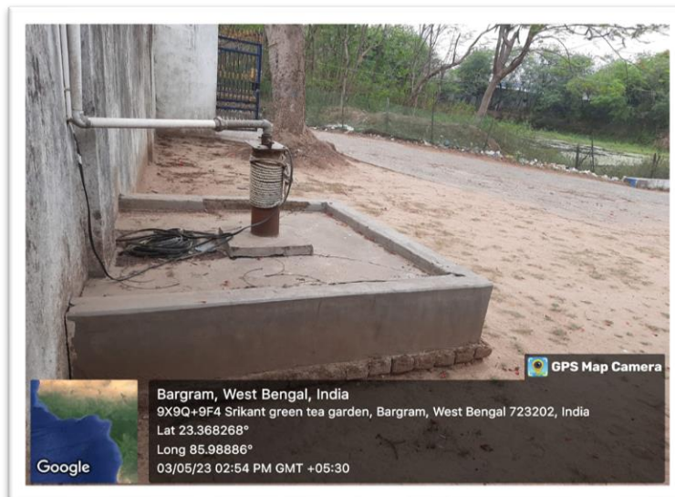
Electric Pump fitted Deep/Underground Boring