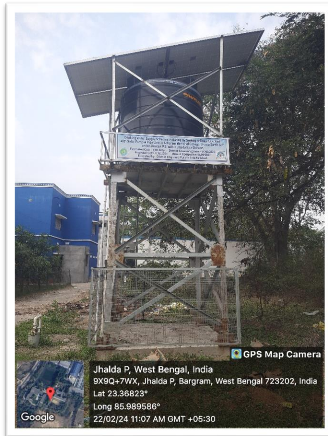
Solar Pump fitted Underground Boring with Water Tank