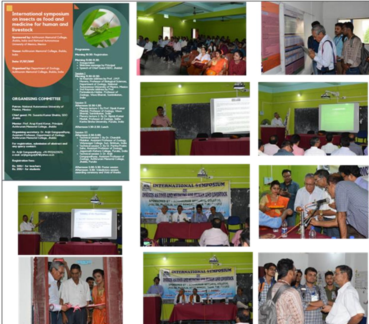
International Symposium on 'Insects as food and medicine for human and livestock'

JHALDA, PURULIA, WEST BENGAL, INDIA, PIN: 723 202