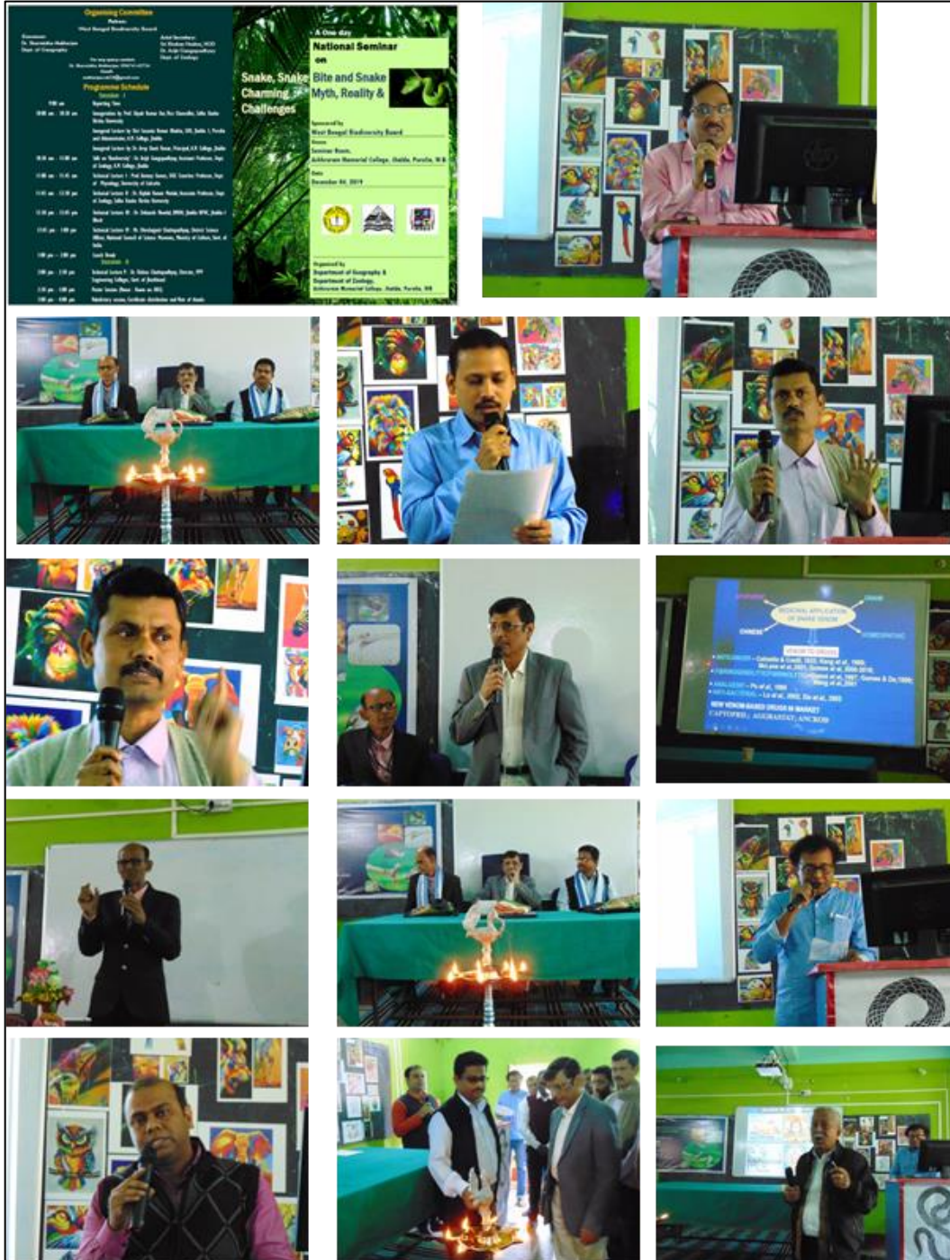
National level Seminar on 'Snake and Snake Bite: Myth, Reality and Challenges'

JHALDA, PURULIA, WEST BENGAL, INDIA, PIN: 723 202