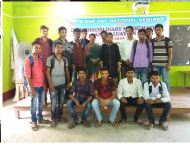
National Seminar on "Interdisciplinary on Mathematics an Evaluation" –IME-2019