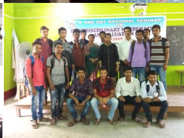
National Seminar on "Interdisciplinary on Mathematics an Evaluation" –IME-2019