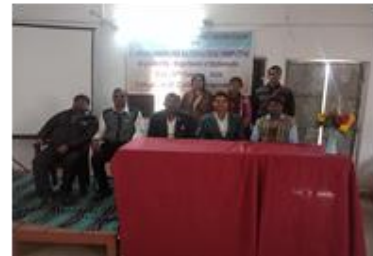
One Day National Workshop on "C-Programming for Mathematical Computing"