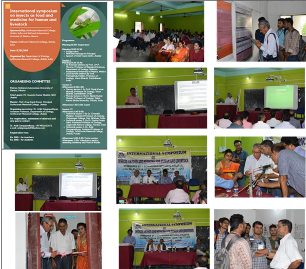
International Symposium on 'Insects as food and medicine for human and livestock'

JHALDA, PURULIA, WEST BENGAL, INDIA, PIN: 723 202